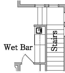
Wet Bar Option