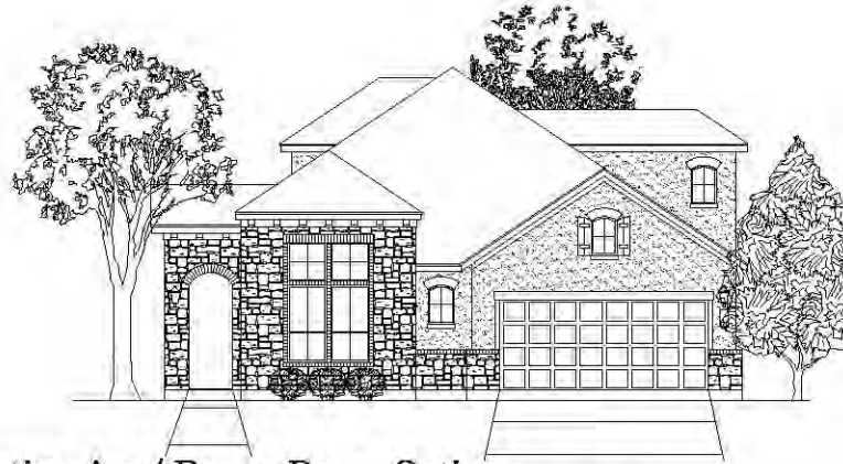
Elevation A w/ Bonus Room Option