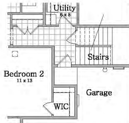
First Floor Stairs w/ Bonus Room Option