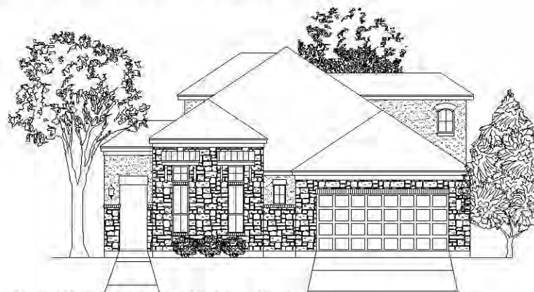
Elevation C w/ Bonus Room Option